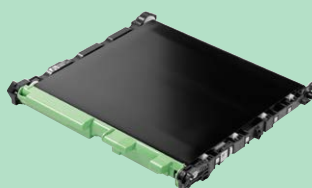
Belt Unit BU635CL