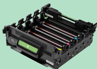
Drum Unit DR625CL