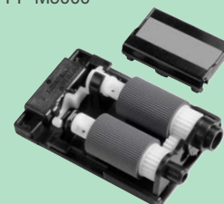
Paper Feed Kit for MP Tray PF-M5000