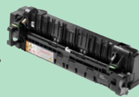
Fuser Unit FD-5000