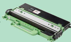
Waste Toner Box WT229CL