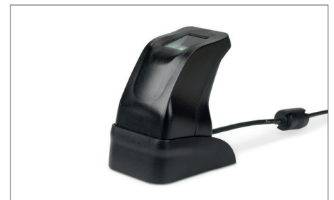
TimeMoto FP-150 USB Fingerprint Reader Art.no: 125-0606