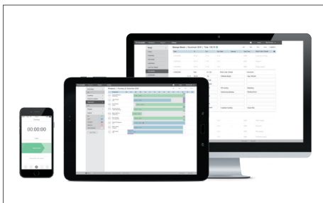
TimeMoto Cloud / TimeMoto Cloud Plus Art.no: 139-0612 / 139-0613