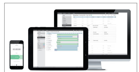
Or TimeMoto Cloud (30 days included)