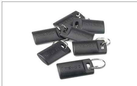
TimeMoto RF-110 set of 25 RFID key fobs Art.no: 125-0604