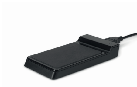
TimeMoto RF-150 USB RFID Reader Art. no: 125-0605