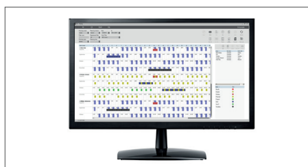
TimeMoto desktop software for single PC use included