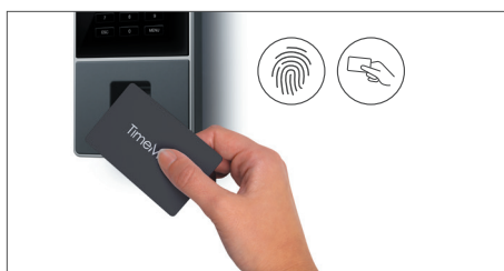
Clocking with RFID proximity card, Fingerprint or PIN code